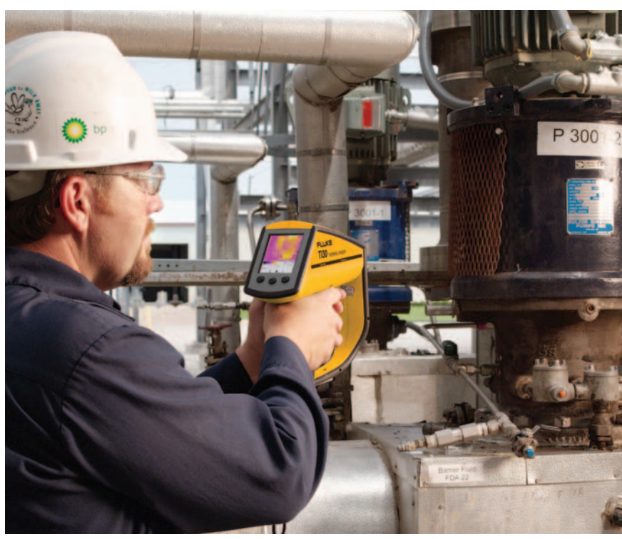
By using thermal imaging, Alltech determined that insufficient airflow and cooling was causing this pump seal to fail, saving a $100,000 project from ongoing seal failure.

This story is about a BP natural gas operation in Ulysses, Kansas. The Jayhawk plant processes gas from the wells of several different companies, including its own. To get the gas from its wells to the plant, BP uses compressor stations that boost the pipeline pressure of the natural gas after it flows out of the ground. At the plant, several processes strip waste products off the gas, verify the refined natural gas meets proper BTU contents for distribution, and produce