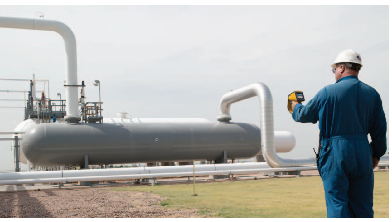
Thermal images of this sludge catcher vessel revealed the line between unrefined natural gas and heated sludge, saving the plant from a major shutdown required for manual verification.

In another case, says Sisk, the plant wanted to determine which valve in a faulty system needed to be replaced. Conventional troubleshooting methods were ineffective due to plant operating constraints and replacing all of the valves would have cost $15,000. So, the plant used the thermal imager to locate temperature deviations in the system, identified the faulty unit, an replaced just one valve.